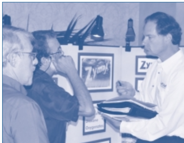
Symposium sponsors and attendees enjoy a conversation in the exhibit hall.

"Perchlorate has now been identified...in at least a dozen food products and two feed crops"