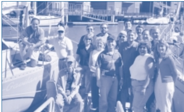
The GRA Directors relax after the August 21, 2004 Board Meeting in Pt. Richmond.

skills, fund-raising, financial management, etc)?