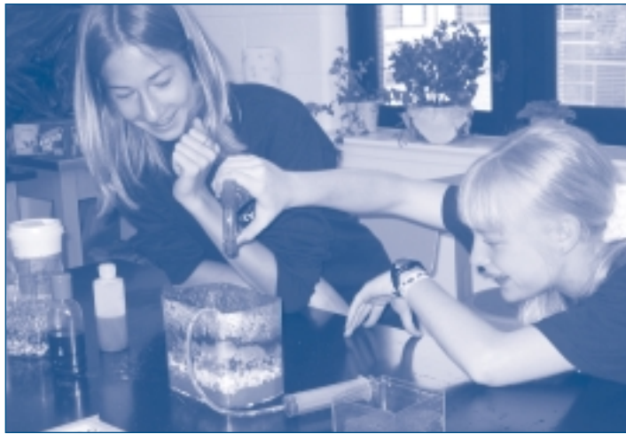
Two enthusiastic middle school students experiment with an aquifer model.

the complexity of an aquifer, and that it is an important water source. In fact, more than 85 percent of the students indicated that the event influenced them to conserve or protect groundwater.